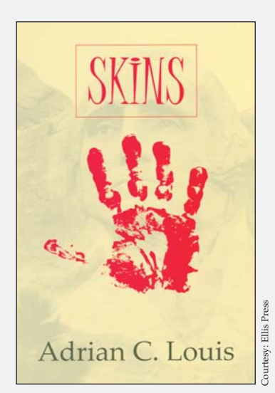
Cover of Louis's novel Skins (1997)

"The Blood Thirst of Verdell Ten Bears" makes it clear that if Verdell is Louis's alter ego, he has been exorcised (BTS). Verdell is walking his usual selfdestructive path in Rapid City when he decides to return to the reservation to kill a man, but when he gets there he goes to "the usual drunken, dope party" (ironically in a housing project named not for Red Cloud but